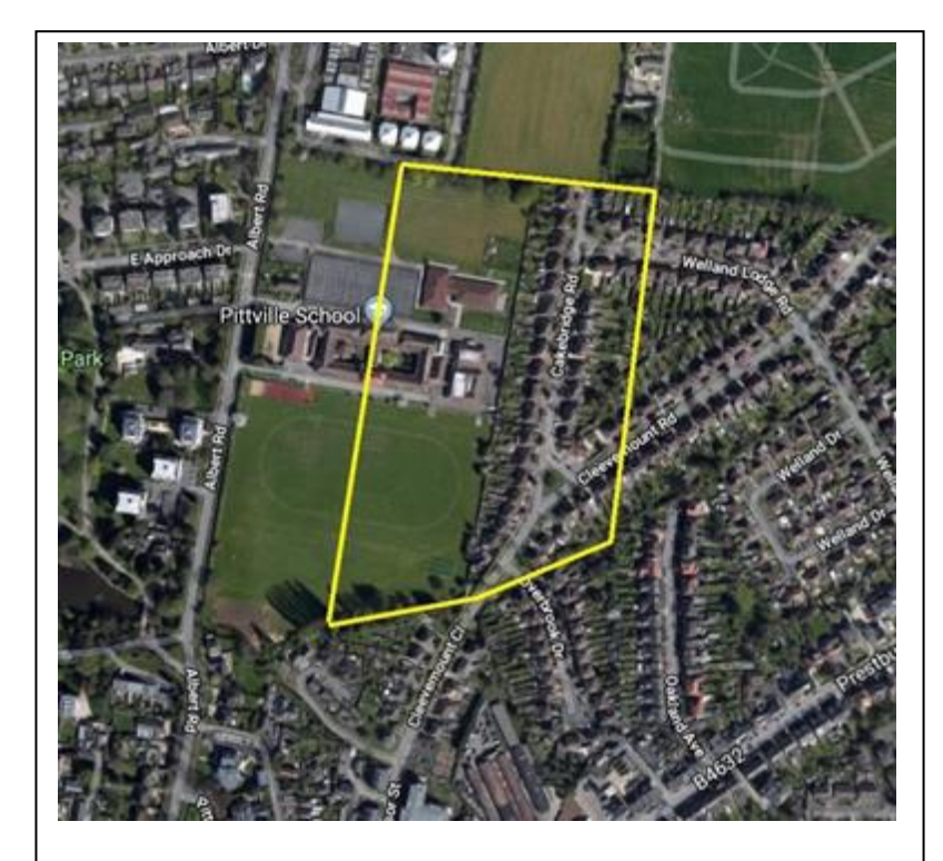
Fig. 3 - The Site of the Proposed Zoological Gardens

One week later, on 8 September, the Cheltenham Zoological Society was confident that since it had sold more than 600 shares in the project the outcome was certain. The Chronicle revealed that a site had been chosen, which it understood to be a field to the east of the Pittville Pump Room, with the advantages of a south sloping aspect and fine dry soil, which was 'of the highest importance in securing the health of the animals'. Considering that the search was only supposed to have begun one week earlier, this choice was clearly predetermined. The field in question was agricultural land in the parish of Prestbury to the north of Wyman's Brook, probably acquired by Joseph Pitt in 1831. In the 1930s this became the location for Cakebridge Road and part of the former Pate's Grammar School for Girls, now occupied by Pittville School, in Albert Road (Fig. 3).