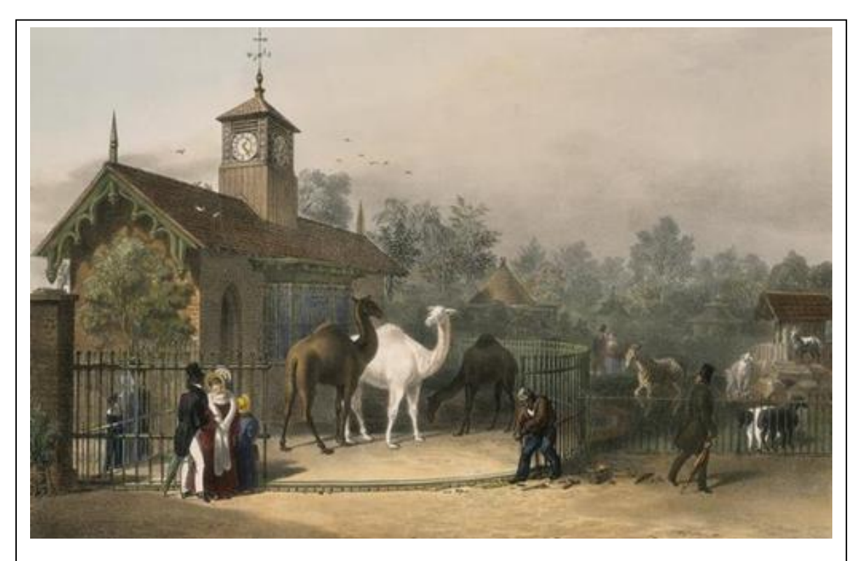
Fig. 1 - The Camel House at Regent's Park in 1835

In the British Isles by 1830 the demand for public entertainment, and the requirements of scholarly research, had come together in the founding of the first modern zoos. There were then only two zoological gardens; in Regent's Park (now London Zoo) and at the Surrey Zoological Gardens in Kennington. However, within five years zoos had been established in Dublin, Liverpool and Bristol, and several more were planned.